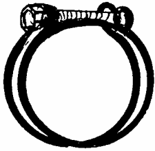
WIRE TYPE OEM HOSE CLAMPS 825-339: 1 1/2" ID HOSE 825-338: 1 3/4" ID HOSE