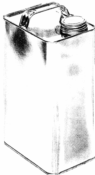
FLUID DRIVE FLUID 1 gallon 934-015